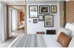
Forward Superior Suite 30 m² Master Suite