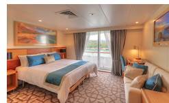
Main Deck A