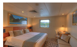
Promenade B Solo