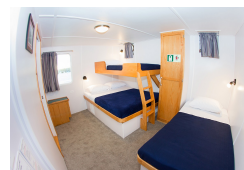
Cabins 3, 4, 5, 6 & 7