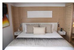
Grand Deluxe Suite