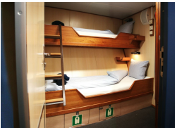
Twin Private Porthole