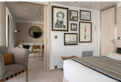
Prestige Stateroom Deck 4