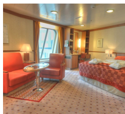
Polar Inside. From